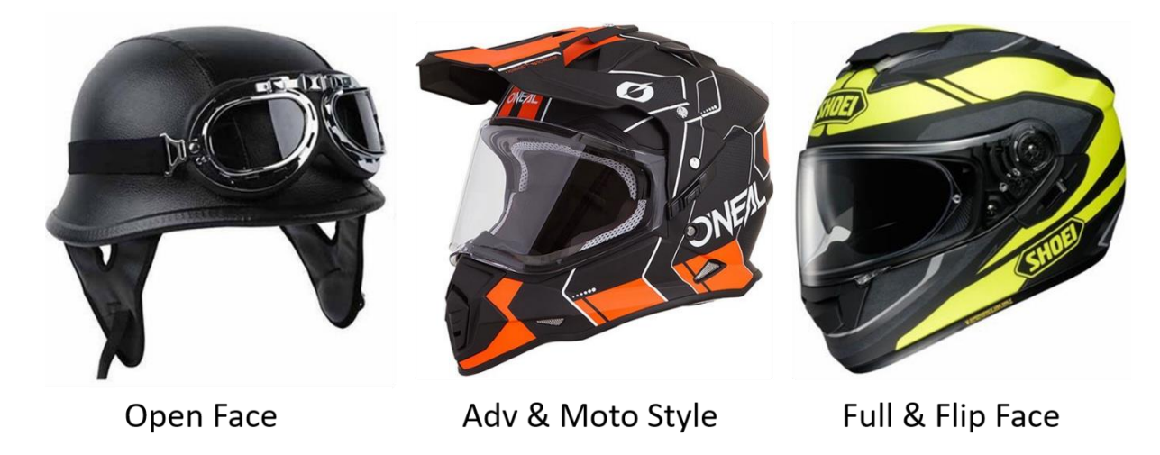
Figure 1 - Helmet Variants

There is a saying "a $10 helmet for a $10 head" and whilst you can spend from <$200 to >$1500 for a helmet your helmet will be (1) new, (2) have an AS/NZS 1698 sticker (yes, there is parallel importing but for now), (3) fit properly and (4) you will look after it. If this is your first or new type of helmet, get someone in-store help to make sure you have the right shape and fit helmet for your head!