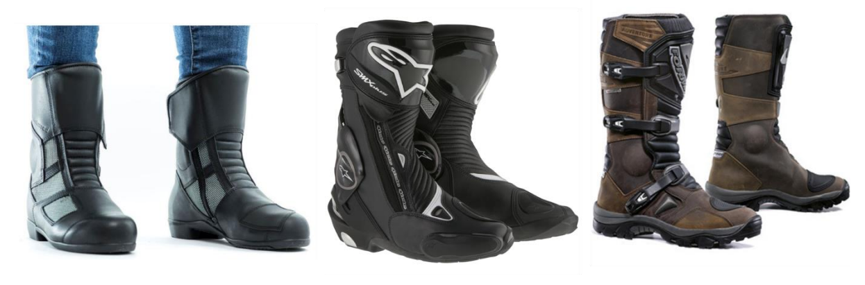
BMW' City Boots