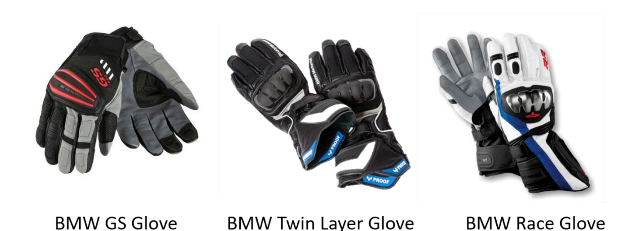
Figure 2 - Glove variants

Waterproof and gloves is not a term that goes together that well and probably has as much to do with all the cut shapes and sewn joints. If this is a problem, there are plastic over gloves available – but do not look to them for tactile feel