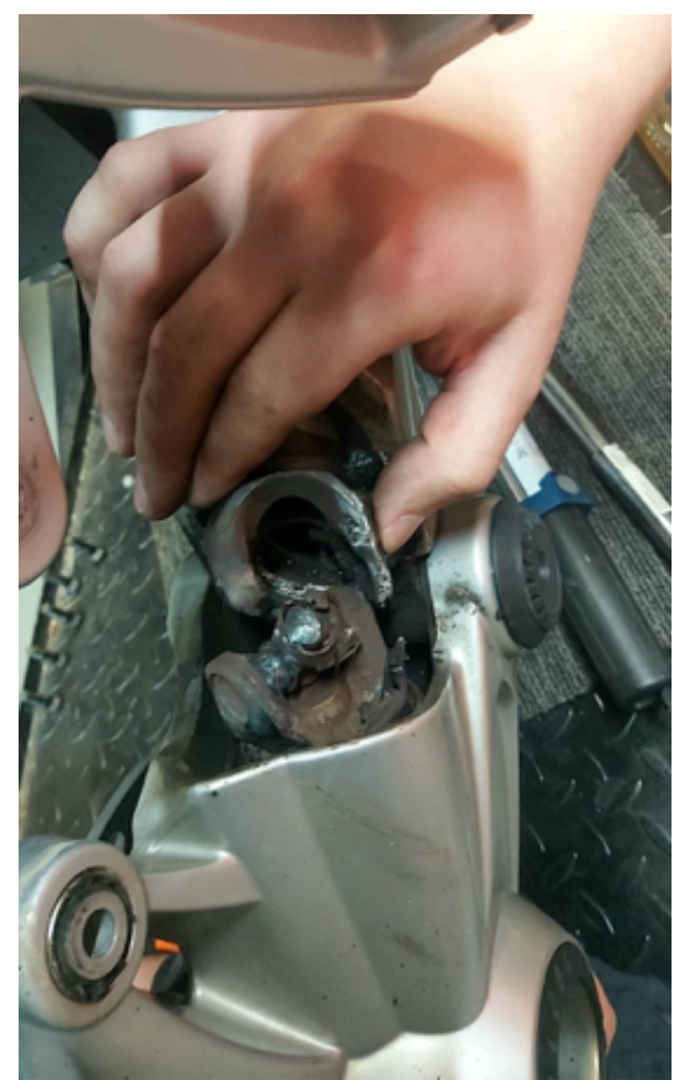
That doesn't look good. This is NOT a cause of spline lubrication or unheard of in Rxxxx motorcycles. Mine was at 136 000km.