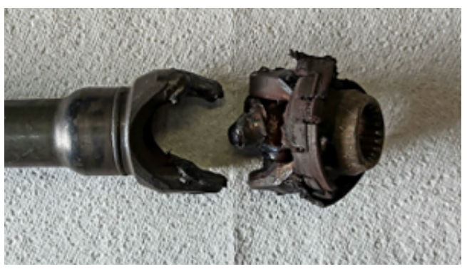
Ordinarily connected together, and another expensive part to replace :)