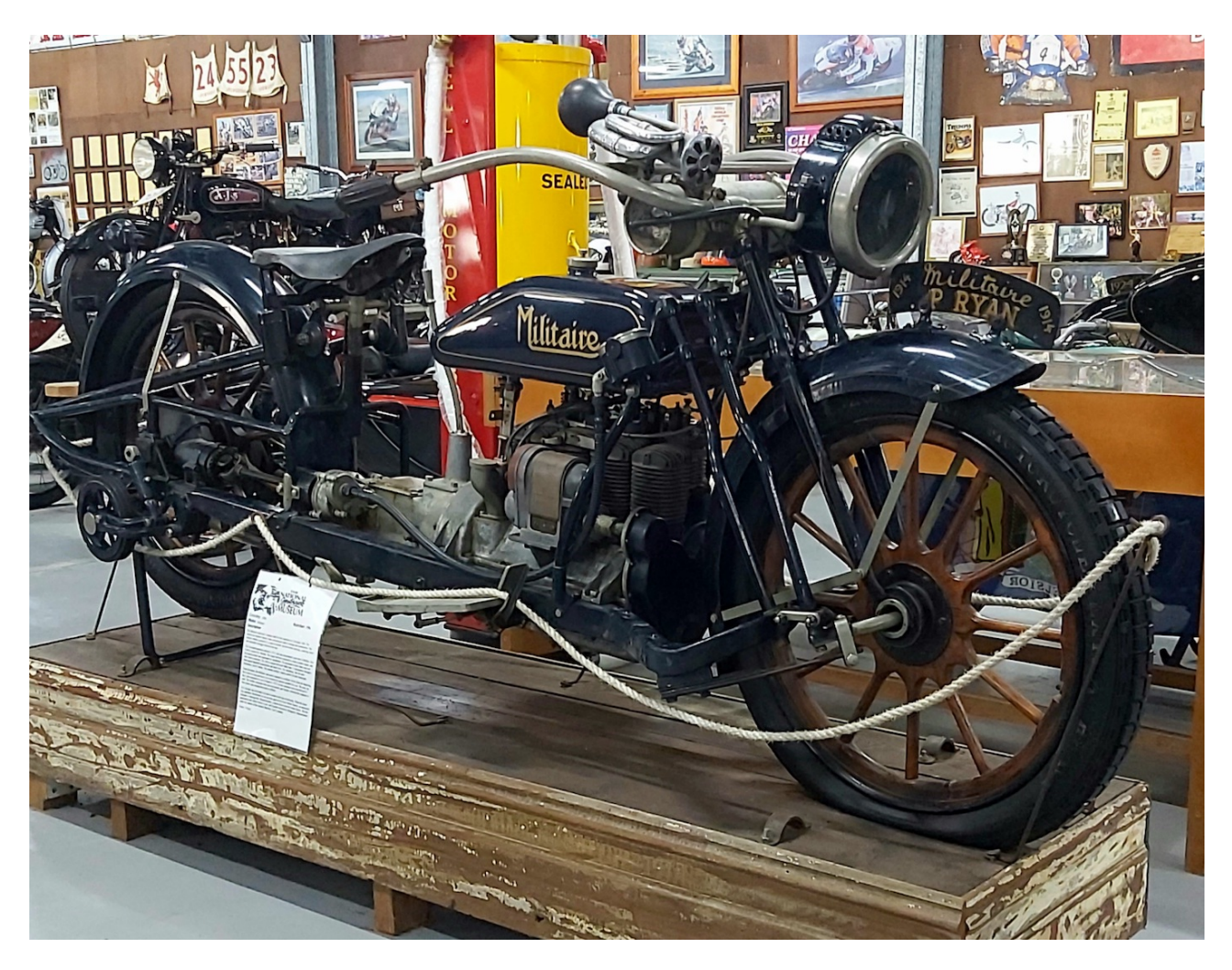
A motorcycle with wooden wheels would be no match for Australia's regional roads. There were some rim dinging potholes for those not paying close attention.

For those owning a motorcycle registered under the ACT <u>CRS</u> (Concessional Registration Scheme) the government has committed to a 60 day personal use + Club Ride scheme that will replace the current Club Ride + 40km service ride logbook scheme. Access Canberra requires a computer system upgrade but the CACTMC aspiration for implementation is for this calendar year. Your bike will transition to the new scheme once implemented on its registration renewal date.