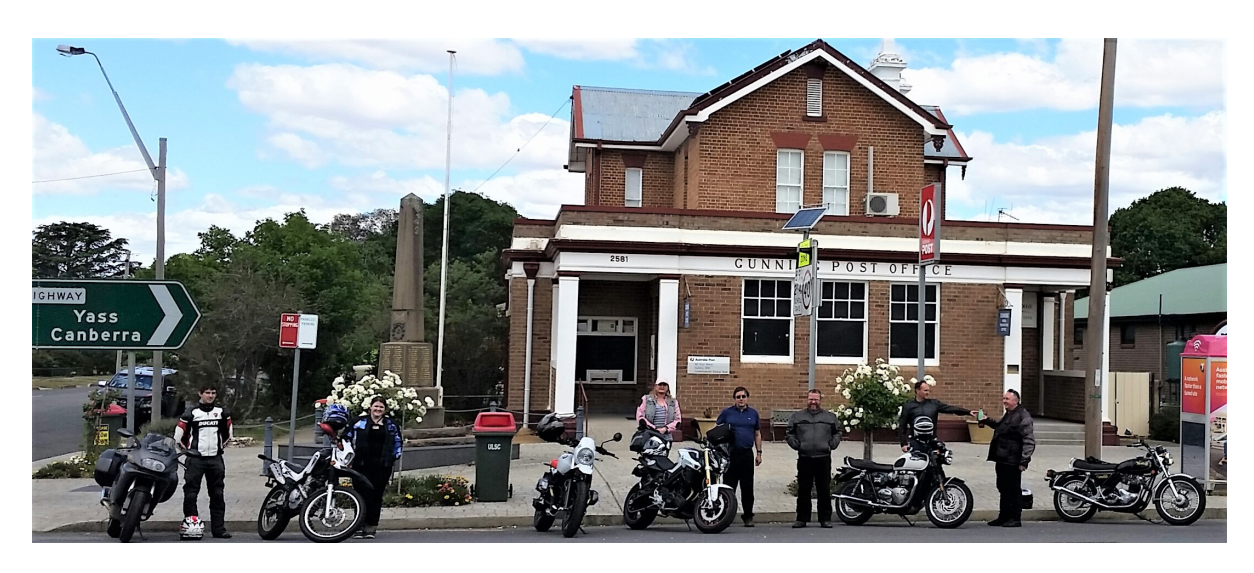
Day Ride via Mtn. Crrek Road to Yass, Dalton, Gunning and Sutton

The <u>BMWMCCACT Club Awards Lunch (Club Event)</u> is on 2 December at the Barracks Cafe Lanyon Homestead, so check your diaries and bring your partner along to this social lunch. You need to have booked and paid to have a confirmed seat by 29 November 2018.