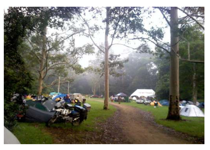
the numbers for a club award with better planning; maybe next year.

Sunday saw us and others make for an early start with a direct route home to Canberra planned. With at least 6 ACT bikes and riders in attendance, from varying locales, we may have had