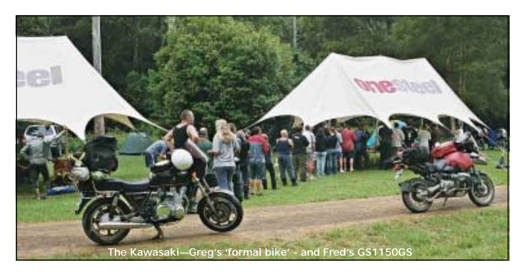
Page 12 — 'Shaft Drive Lines' April 2005