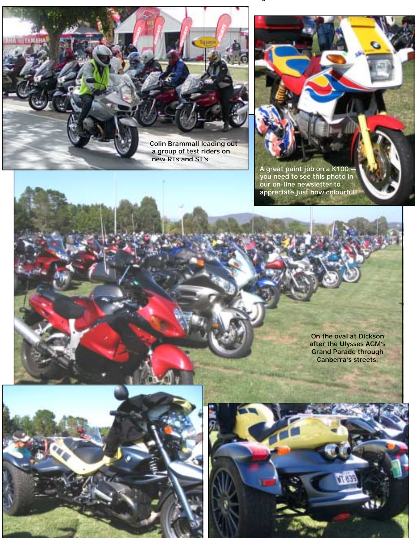
We admired the engineering and the quality workmanship of this R1200CL to Trike conversion