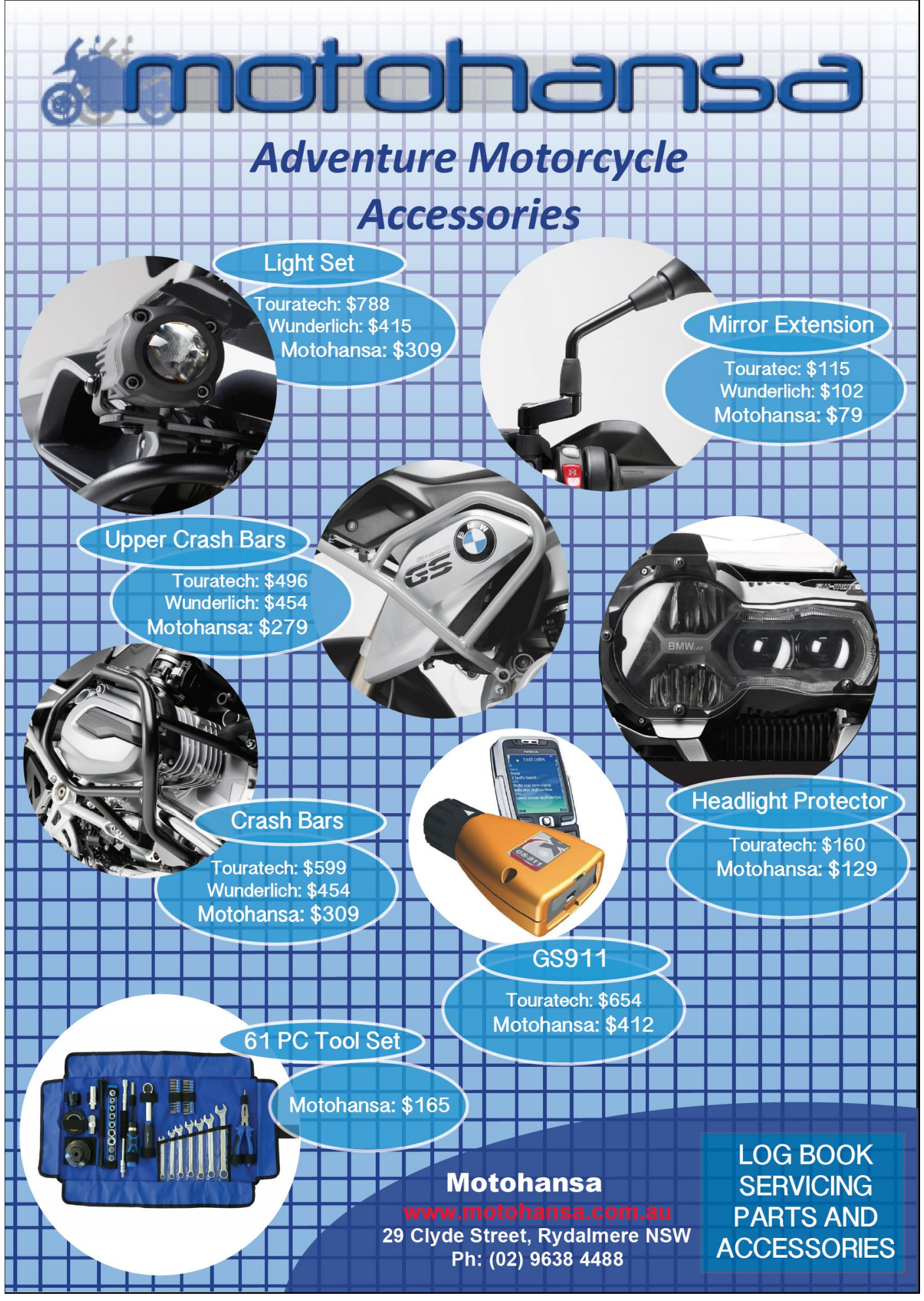
Shaft Drive Lines, December 2013 - Page 7