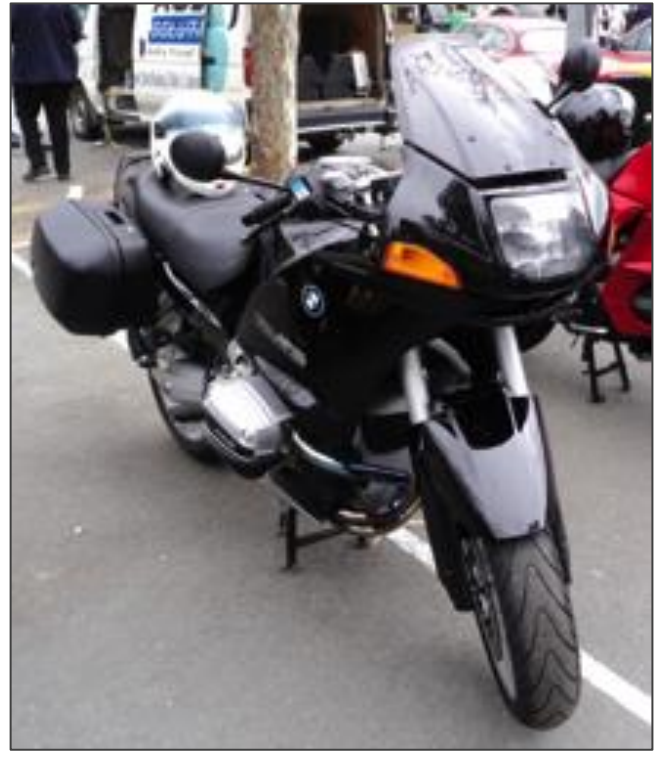
BMW R Series >1995 Ian Leyton-Grant R1100S