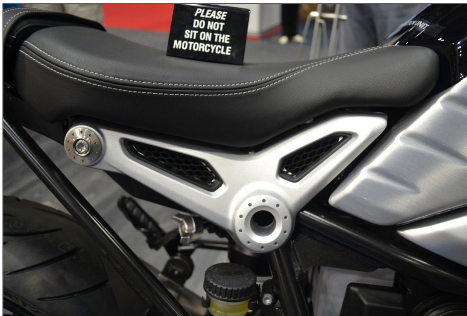
BMW R nineT