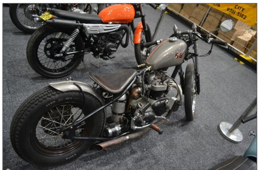
Build your own bike from stuff in the shed, this guy did.

I now have a head full of ideas for my R80 project bike.