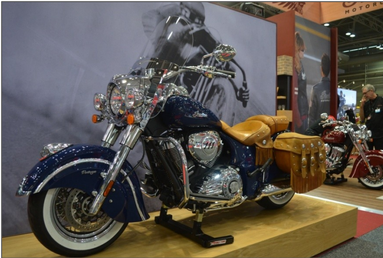
Indian with lots of cow hide

I packed the mighty R1200R on the Friday and headed to Sydney with the chatty GPS to give me directions to Western Sydney and my accommodation in Emu Plains. Why so far west, I hear you ask? I hate Sydney traffic and I was to join the club ride to Lithgow and Oberon on the Saturday, so I was halfway there. The train ride into the city was quicker than riding and no parking or security issues once I arrived at Darling Harbor Exhibition Centre.