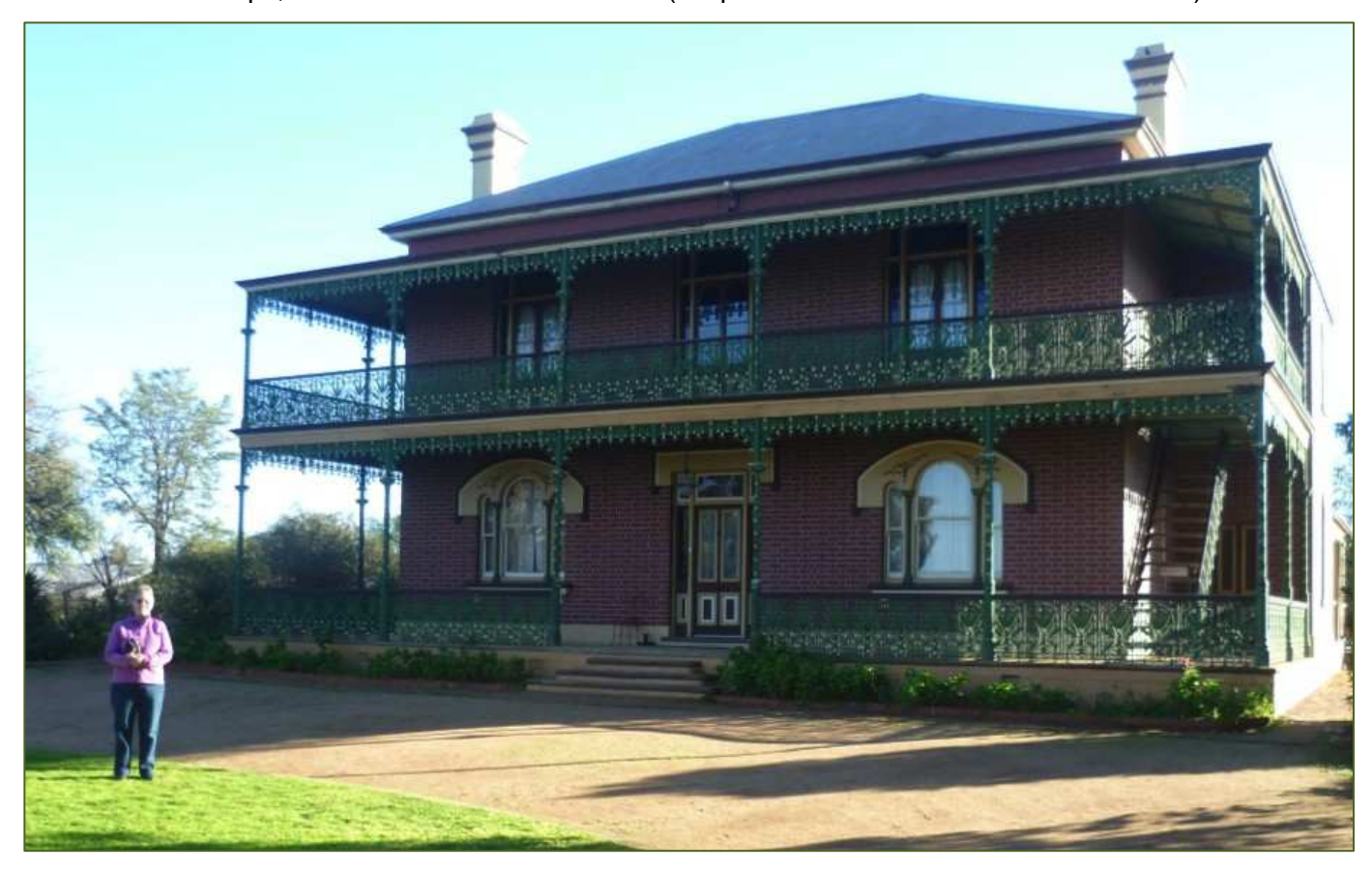
Monte Cristo Homestead, Junee

After a light lunch in the old world charm of the Railway Station Cafe, we secured some accommodation at The Crossing Motel, and then decided on what we'd do in the touristy vein. Junee's main claim to fame is that it was, and still is to a lesser extent, a major rail hub. One of the engineering wonders is the Roundhouse, a major workshop constructed in the late 1940s during NSW rail's heyday, half of which is still in use as workshops; the other half now a museum (we planned to check it out on the morrow).