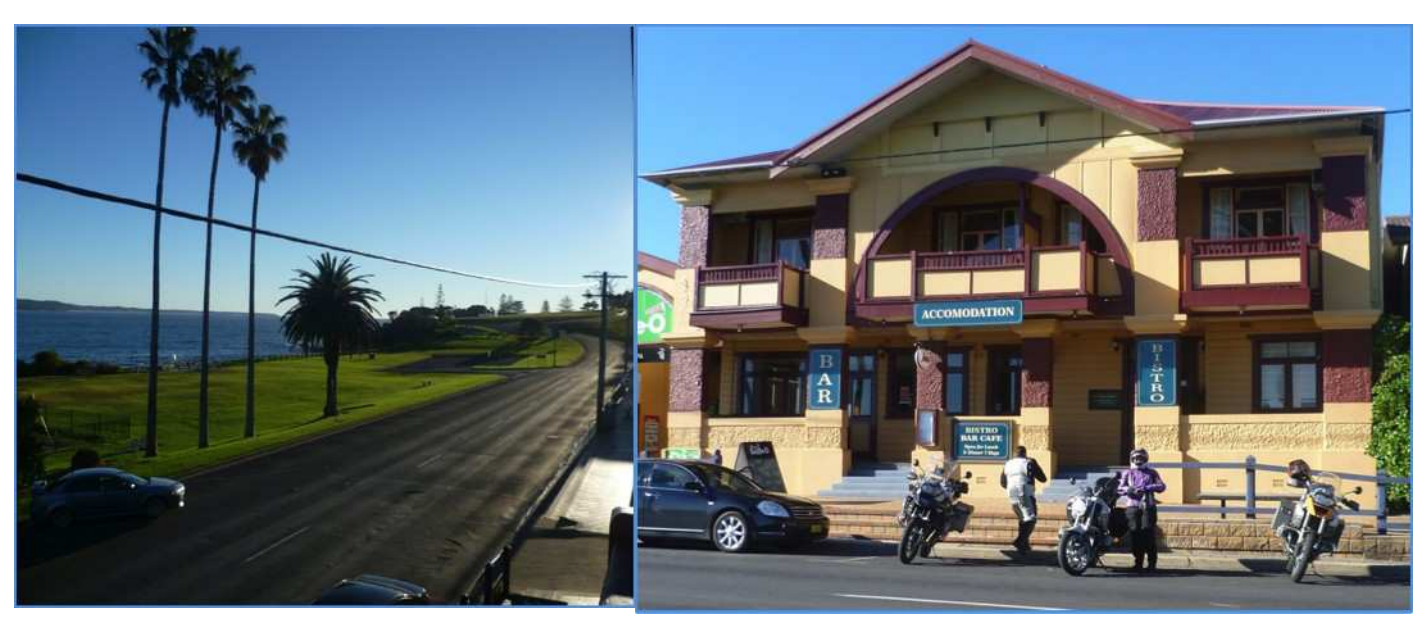
Sunday morning view from the Bermagui Pub balcony.

After we all checked into the Bermagui Beach Hotel, there was time for a stroll around the foreshore area and harbour environs. Bermagui, it should be noted, is the closest point on the Australian coast to where the continental shelf drops off into the deep-water abyss. For this region, Bermagui has for years been a mecca for big game fisherman from around the world, such as the author of many western novels, Zane Grey. Also in town on our weekend was the Westpac Rescue Helicopter and Navy Bell 429 training and utility helicopter, employing the local Australian Rules Football oval as a helipad for the weekend (clearly, the local AFL club had "away" games that weekend). Both helicopters were operating in support of a multi agency Search and Rescue Exercise (SAREX) held offshore from Bermagui. In any event, they provided some entertainment for the locals and visitors alike.