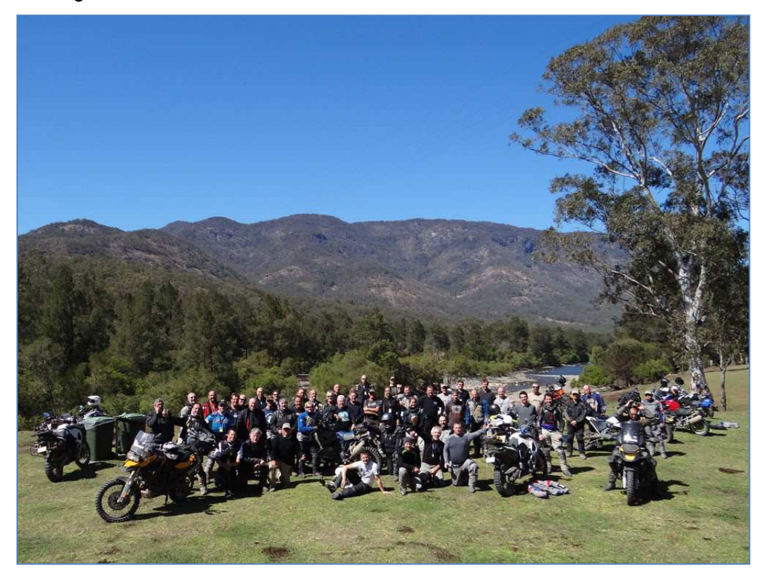
The 2012 GS Safari Participants