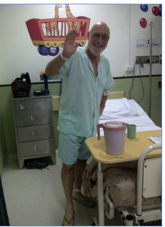
Feeling better, Mt Isa Hospital