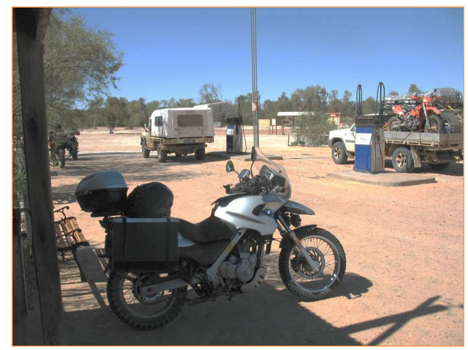
Mungerannie, Birdsville Track, SA

The initial clinical assessment at the Birdsville Clinic did not warrant an airlift to Mt Isa. However, I did so myself 3 days after the event, and was admitted to Mt Isa Hospital for 4 days. There, they established that I had sustained five broken ribs and a small haemopneumothorax. I subsequently arrived home on 13th April after a 52-hour bus journey having strict instructions not to fly for several weeks! My insurance company trucked the bike direct to Brisbane for assessment.