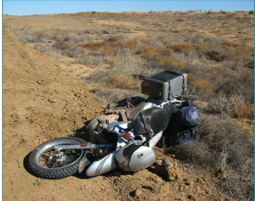
A sore and sorry F650GS