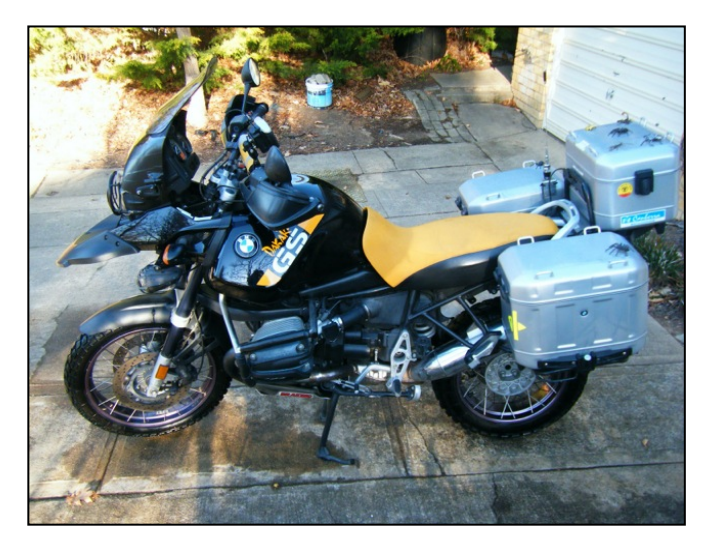
Please no 'tyre kickers' and contact me on Matt (Red Hill)

2010 G650GS - Only 20km! Yes, that's right.