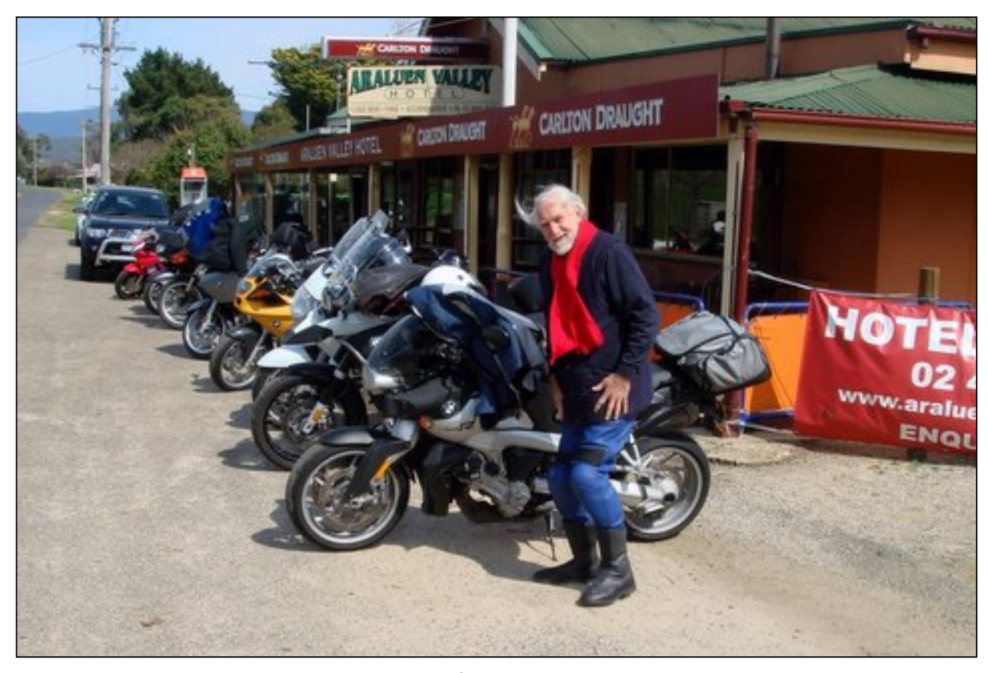
Araluen \underline{\mbox{Bike}} & Top Down run 4 September 2011.